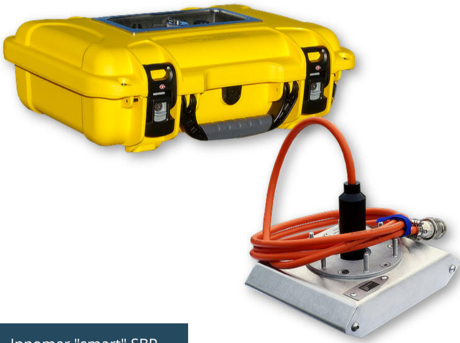
Innomar "smart" SBP

The Innomar "smart" model is the smallest member of the Innomar sub-bottom profiler family. It has been designed for inshore surveys in shallow waters down to 100 metres water depth using small boats, but can also be used in coastal areas.